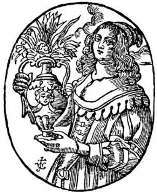
Personification of Spring