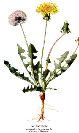
DANDELION Lactuca taraxacum L. CICHORY FAMILY